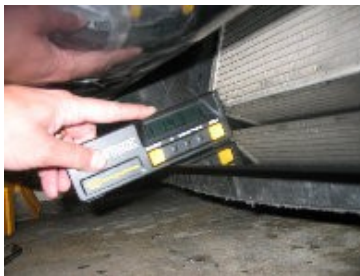
Side view 1989-1996